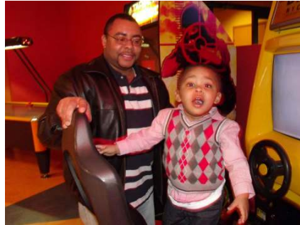
Bro. President and future president.