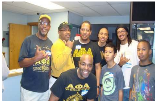
Alpha Brothers at Wayside Christian.

We are as relevant as ever. Greek life is still a vital force of the college campus and outer community. It is up to those who are members to continue to push forward in advancing the causes of our organizations and providing a valuable service to our communities.