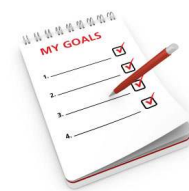
Write down your goals.

4) Don't get down on yourself for missteps. If you fall off the wagon don't throw up your hands and say I quite. One bad decision doesn't have to lead to another. If you picked up a doughnut for breakfast it's ok, make sure you opt for the salad at lunch. Nobody's perfect.