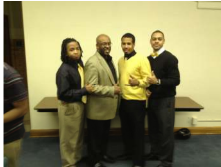
New Brothers at their welcome reception.